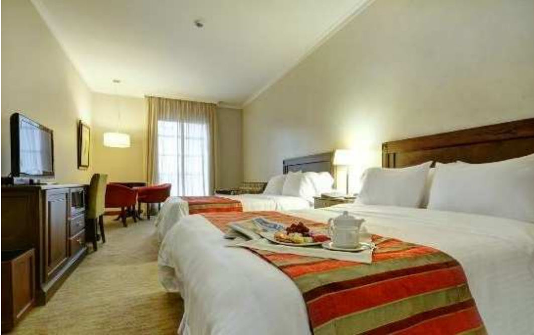
A double room at the Dann Carlton