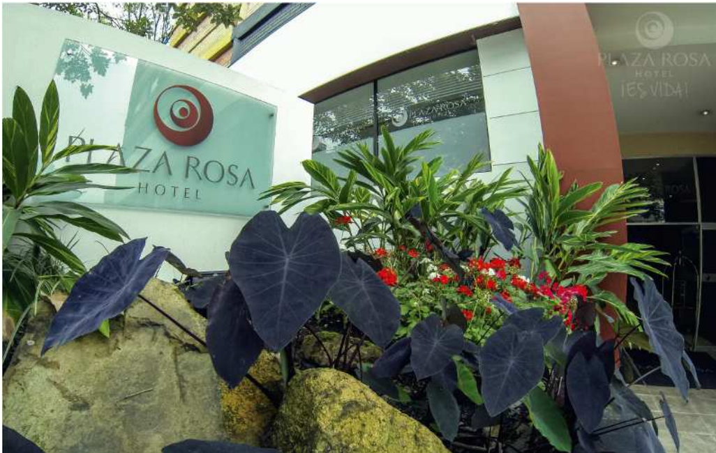
The entrance to the Plaza Rosa