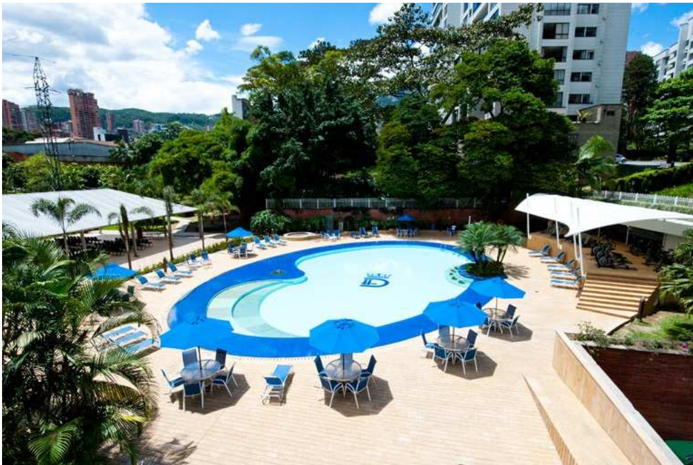
The swimming pool at the Dann Carlton