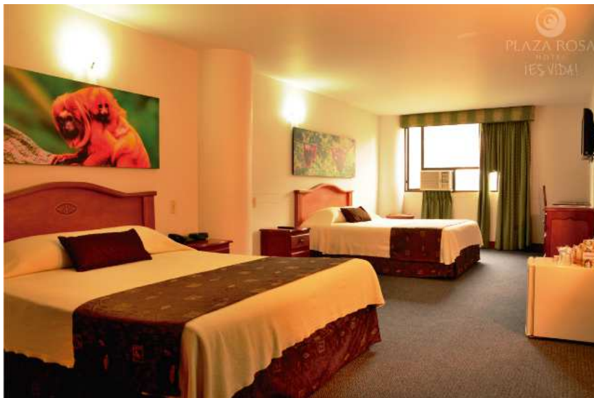
A double room at the Plaza Rosa