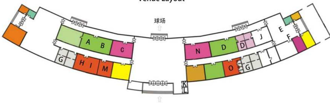
功能室分布平面图 Venue Layout

2015 “陆家嘴金融城杯” 射箭世界杯赛(上海站) Archery World Cup 2015 - Shanghai