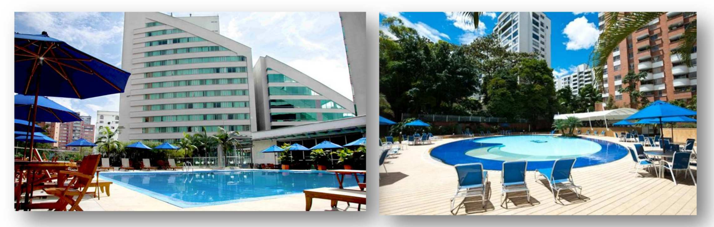
The swimming pool at the San Fernando