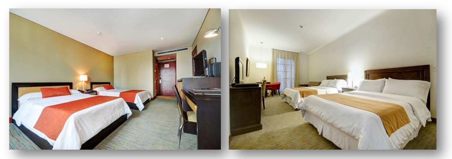
The twin room at the San Fernando