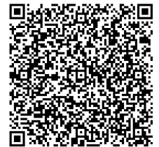
HAWC 2 - Shared Schedule

Please frequently refer to World Archery website for latest updates of the schedule, as changes may occur during the week.