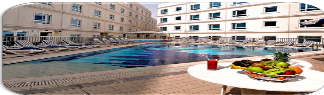
Accessible Swimming Pool