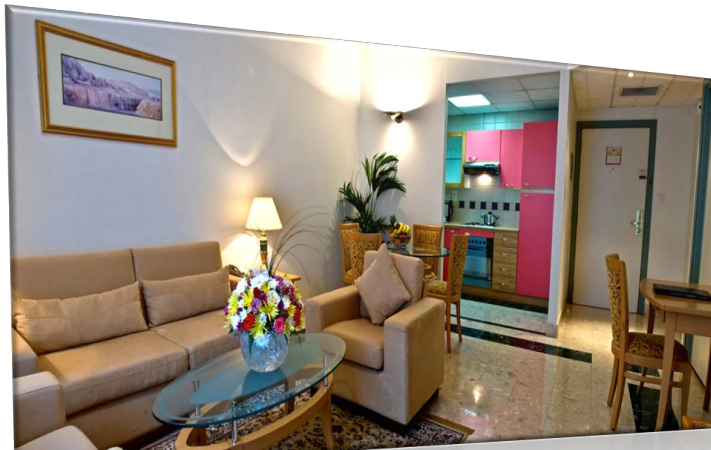
Apartment "Triple room" (1 single room + 1 double room and 2 bathrooms).