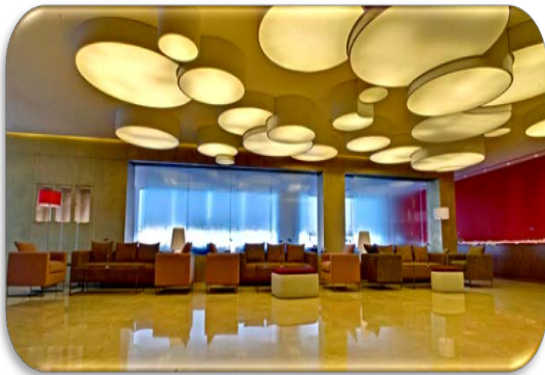
Free Internet at the Lobby