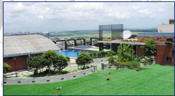
Roof Top Restaurant & Swimming Pool