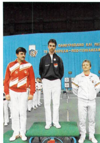
The individual and team winners in the front of the tribune