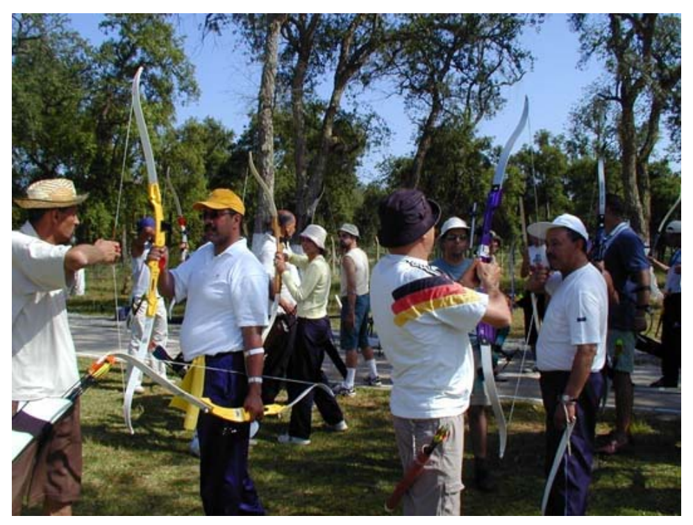
Participants in the Coaching Course in Morocco