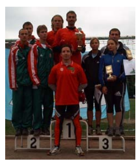
The Team Event podium