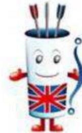
Field World Championships 1-6 September 2008