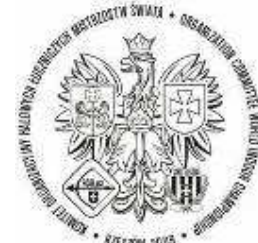
Indoor World Championships 4-8 March 2009