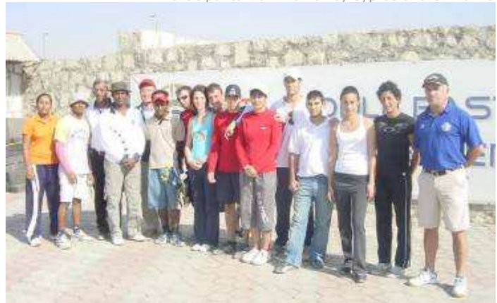
Participants from Romania, Cyprus and Sri Lanka

The training camp focused on the preparation of the national elite teams with their national coaches. The programme was mainly composed of equipment tuning as well as technical, physical, psychology training of elite athletes and the teams have refined archery skills for their future.