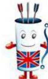
Field World Championships 1-6 September 2008