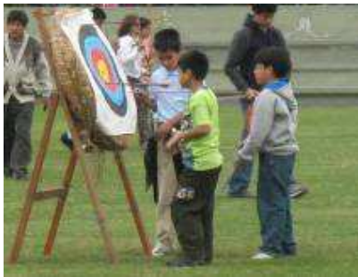
Archery initiation for children

This donation from FITA and the development will of Peru demonstrate that when both efforts are combined we can enhance the development of archery.