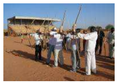
Carpenters using their bows

During the closing ceremony the National Olympic Committee's Secretary General declared he had been surprised by the work accomplished in such a short time. He took the opportunity to offer two bows and arrows to the Minister of Sports.