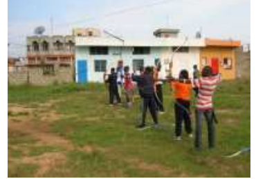
Use of modern bows