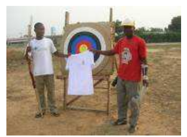
Awards to the best archers

Coming back from the African Championship in Cairo, the archers could not start the training sessions with the bows used in competition as they were being repaired; instead they used the practice bows to prepare the national legs where modern arrows will be used in the team event. At the nationals every department will register its best archers in both genders.