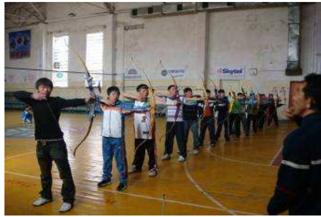
Youth training camp sessions