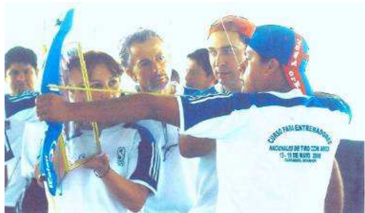
Perfect collaboration between Ecuadorians and Paraguayans

Ecuador benefited from an Olympic Solidarity course for archery coaches. It was an intermediate level course held at an excellent centre of high performance in Duran in the suburbs of Guayaquil. The centre belongs to the Ecuador National Olympic Committee. This course gathered 26 participants including 3 from Paraguay, 2 from Cuba, 1 from El Salvador and 1 from Korea. Gender equity was respected and 10 participants have successfully completed the final evaluation.