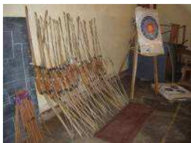
Exposition of bows and arrows