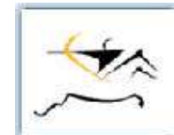
Youth World Championships 6-12 October 2008