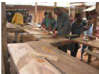
At the workshop

This seminar was the object of a big campaign of media coverage at the level of all national press (see www.lejourquotidien.net ).