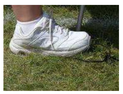
The device is used by an athlete to stabilize the athlete's stance, by standing on it.

The Constitution & Rules Committee finds the question presented to be within terms of reference of the Technical Committee, and has determined that the following Interpretation of the Technical Committee is not contrary to the existing rules or Congress decisions.