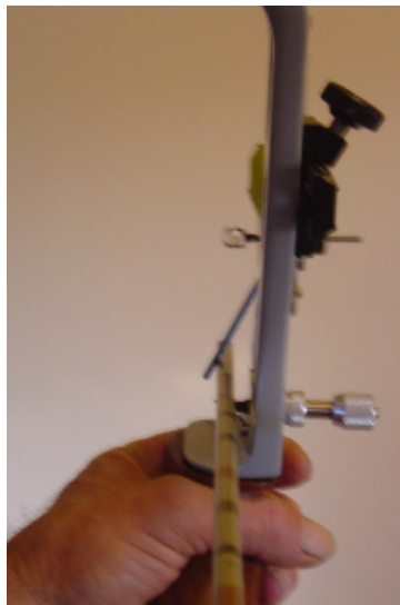
End view – before release