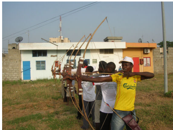
Competitors using locally manufactured equipment (right) and imported industrial equipment (left)