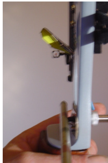
End view – during release