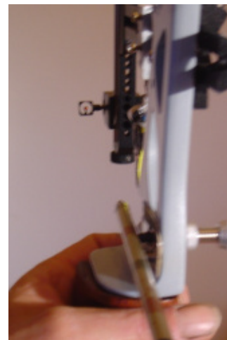
End view –after release