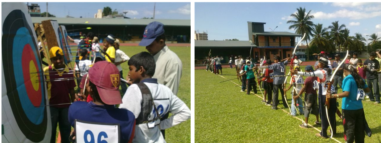
During the competition

Archery took firm root in Sri Lanka after receiving FITA's assistance in 1999. The growth of archery is relatively slow due to the lack of equipment but the high number of participants at this competition is a satisfactory indication of the future of archery in Sri Lanka, with a population of 20 million.