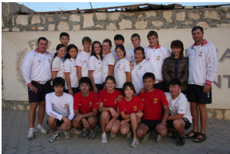
Russian National Junior Archery Team