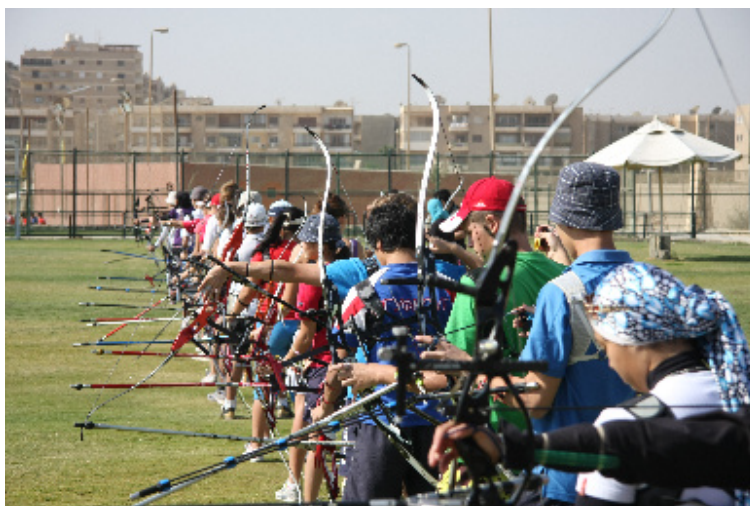
Egyptian National team with Russian junior archery team in practice.