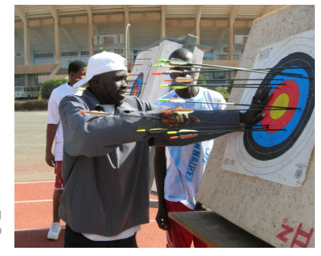
Arrows recuperation during the national championship