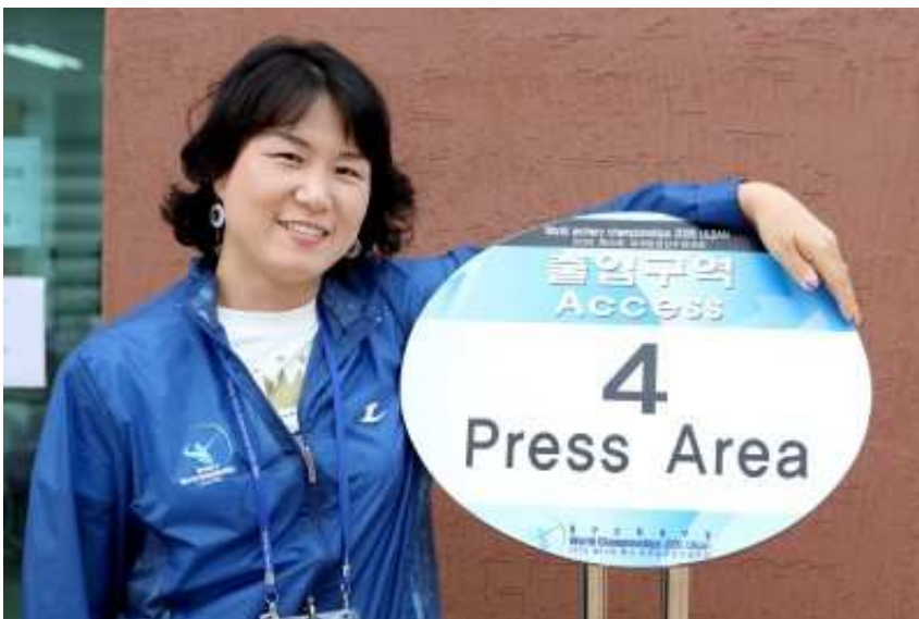
Working as a Media Director at Ulsan 2009 World Championships