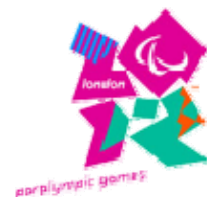
Paralympic Games 29 August-9 September 2012