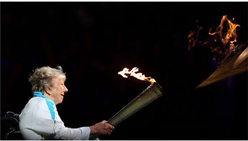
Margaret MAUGHAN

On 29 August 2012, the 84-year-old archer fittingly concluded the Opening Ceremony when she lit the cauldron to mark the start of the London 2012 Paralympic Games following an emotional and spectacular show.