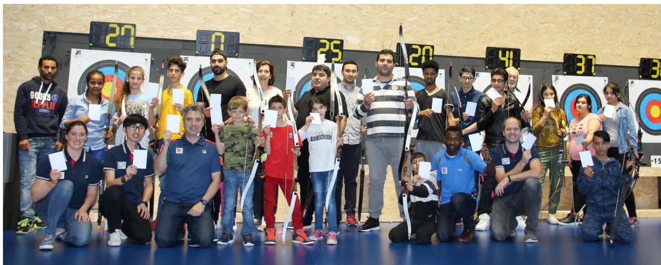
Peace and Sport Day at World Archery Excellence Centre in Lausanne

The International Day of Sport for Development and Peace was held on 6 April 2017. World Archery thank those who took part in the celebrations and activities.