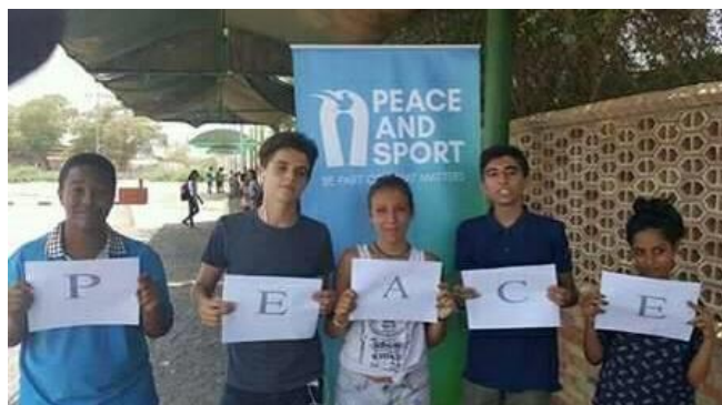
Peace and Sport Day in Djibouti