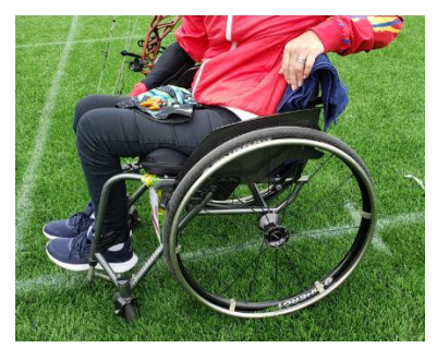
Support below the pelvis

Below is a picture of side support that does not give trunk support to an athlete because it is below the pelvis (waist height). Because it is not giving support, it can be greater than half the body width of the athlete. It is very common to see this on the athlete's wheelchair.