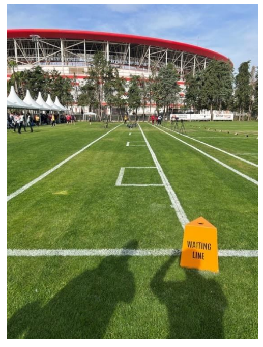
FOP layout with the Media Boxes.