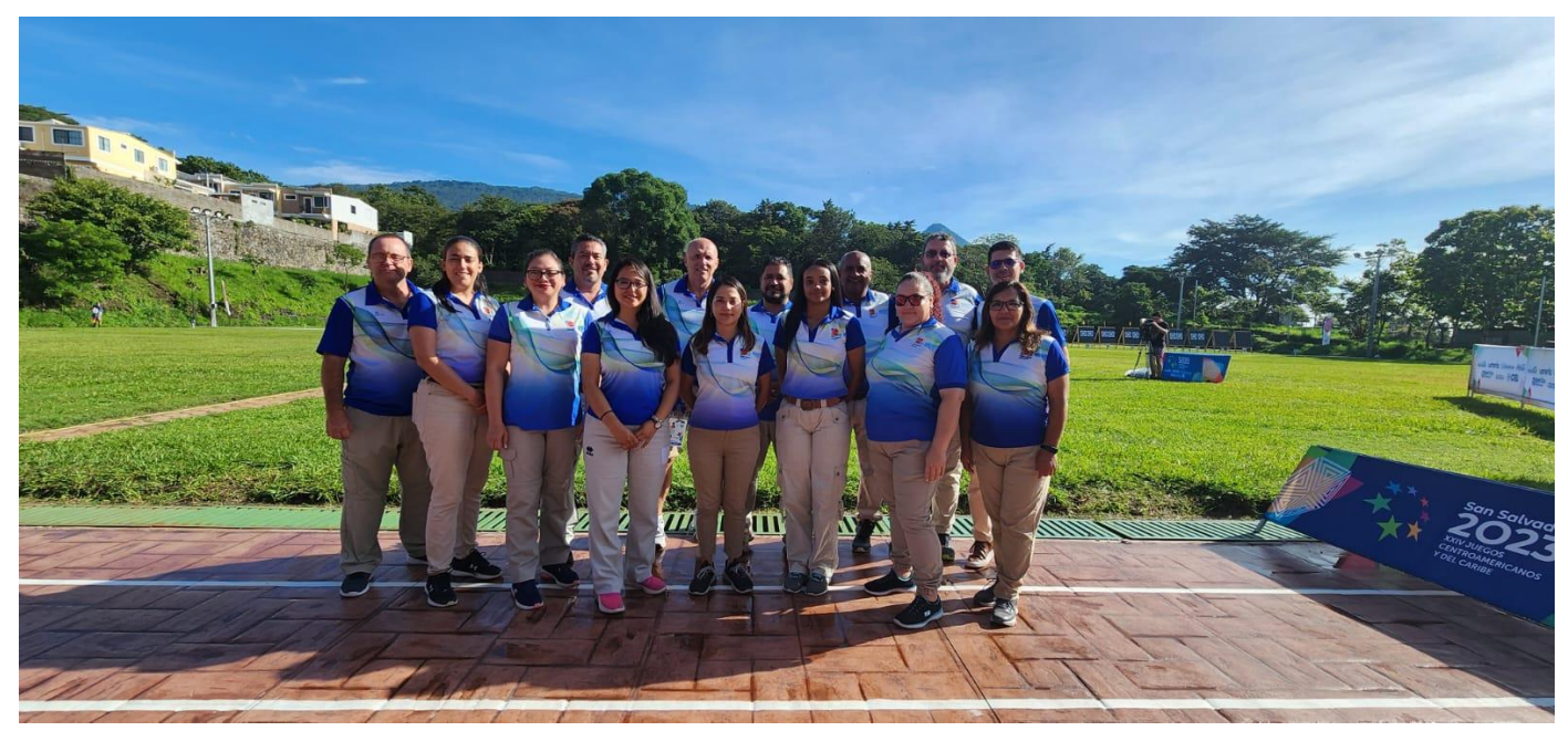
Central American and Caribbean Games in San Salvador