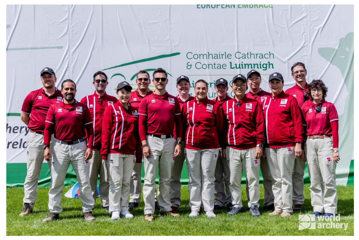
World Youth Championships in Limerick, IRL