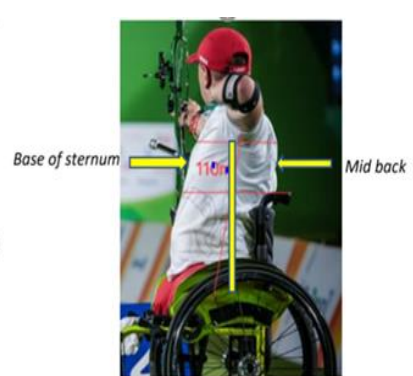
Measuring half the body width

So what is lateral support? Lateral support is defined as anything that prevents the athlete falling sideways in the chair by providing support to the side of an athlete's trunk. The rules state that a lateral support may not protrude further forward than half the width of the athlete's rib cage. It is measured as the halfway point between the base of the sternum (breastbone) and the spinous process at T7 (mid back).