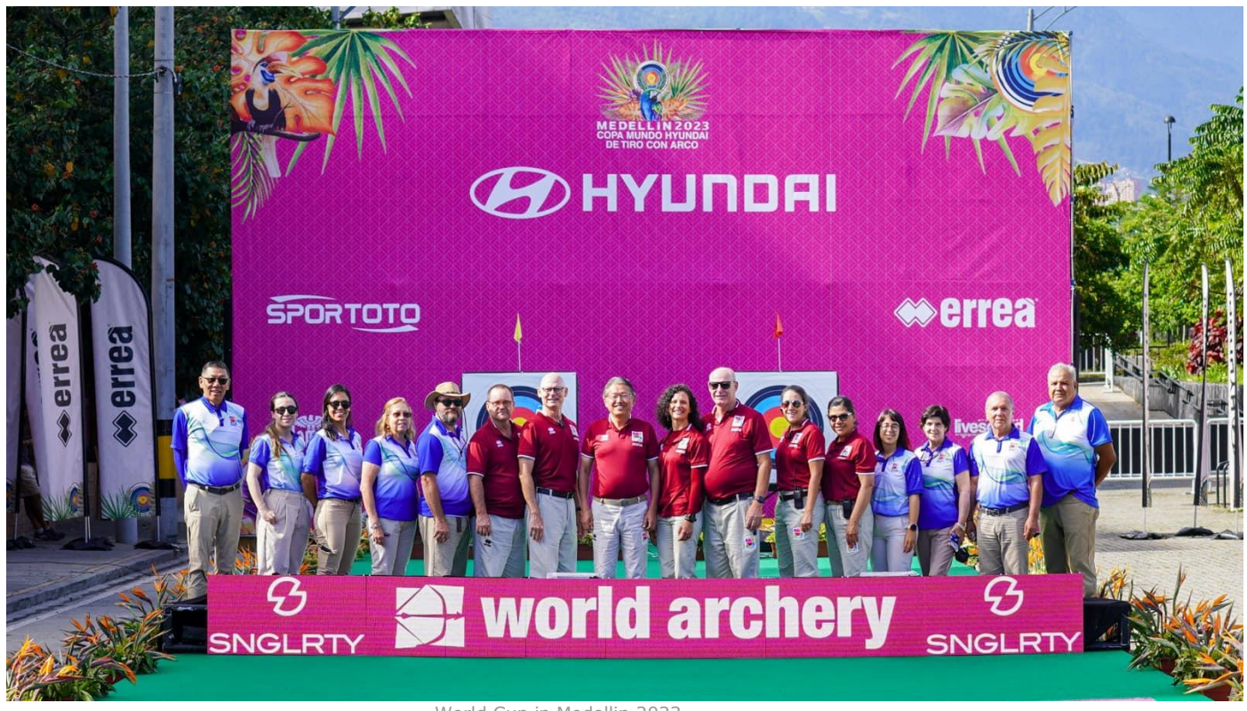
World Cup in Medellin 2023