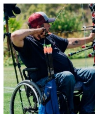
Athlete using armrest as lateral support

A last consideration of potential lateral support is the armrest. Because they are normally above th pelvis and longer than half the width of the athlete's body, they are considered lateral support and the athlete may not lean on them during their shot process. It is our job to observe whether or not they are using it and ask them to move it away from their body. Many athletes have arm rests but do not lean against them while shooting.