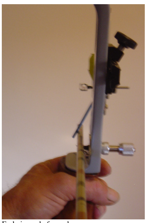
End view – before release