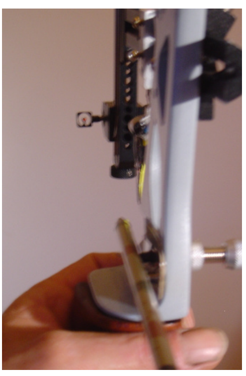
End view - after release

The Constitution and Rules Committee finds the question presented to be within terms of reference of the Technical Committee.