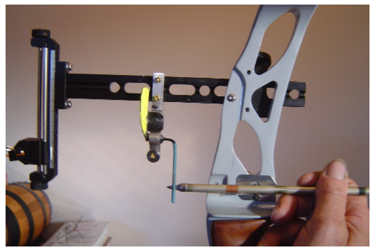
Side view – before release

Archery Australia Inc. has requested an interpretation of whether or not the visual clicker as shown on the pictures below is legal.